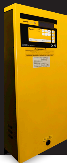
Top Up Pressurisation Unit

The unit is easy to install and commission and housed in a compact, enclosed unit, making it suitable for wall mounting. Ideal for small commercial or large domestic applications.